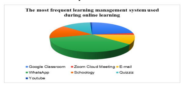
Figure 1 Online Learning Applications Most Frequently Used by Lecturers

2) Online learning practices often performed by lecturers