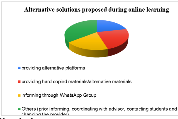
Figure 4 Alternative Solution Conducted by the Lecturers During the Online Learning

Henceforth, the potential solutions to such problems are represented as follows: 1) prior information in WAG, advisory coordination, contacting absented students, 2) providing hard copied materials, 3) providing alternative accessible learning platforms, and 4) changing the internet provider.