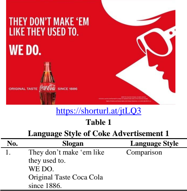
Figure 1 Coke Advertisement 1

The advertisement above is a coke advertisement of Coca Cola. This product convinces their consumers that their product recipe is always the same as they made them since 1886 until now, 137 years away since they first made it. Language style used in this advertisement is comparison. The comparison is the way ads convey an idea or message by comparing certain products with other products. It differentiates two or more products and usually considers the advertiser's brand to be superior (Wells, 1995).