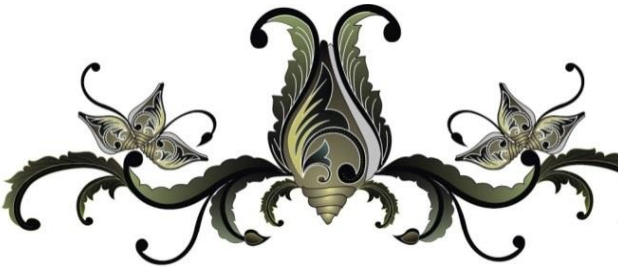
Dekranasda Batam 2022